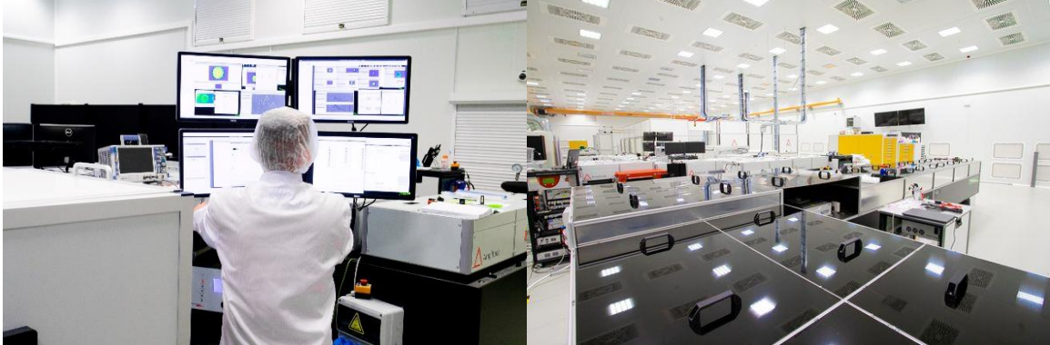
The state-of-the-art research capacities at the ELI Facilities

The ELI ERIC operates as a single multi-site organisation with complementary facilities specialised in different fields of research with extreme light: ELI Beamlines in Dolní Břežany (Czech Republic) and ELI ALPS in Szeged (Hungary). Between the ELI ERIC Facilities, over 600 scientists, technicians, and support staff work together to enable user access and breakthrough science.