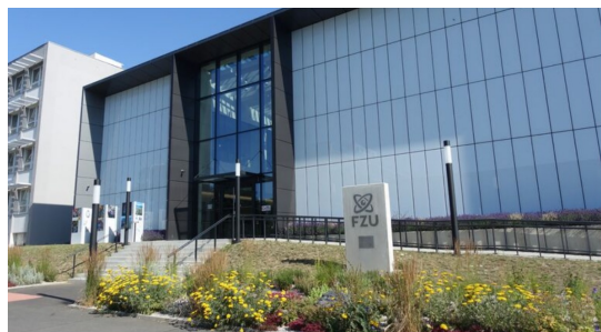
Conference Venue Institute of Physics | SOLID21 Hall | Prague 8

Oral and poster presentations Instructions on the conference website