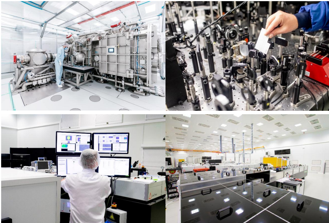
The state-of-the-art research capacities at the ELI Facilities

The Extreme Light Infrastructure (ELI ERIC) is the world's largest and most advanced collection of high-power lasers. As an international user facility dedicated to multi-disciplinary science and research applications, ELI provides access to world-class high-power, high-repetition-rate laser systems and enables cutting-edge research in physical, chemical, materials, and medical sciences, as well as breakthrough technological innovations.