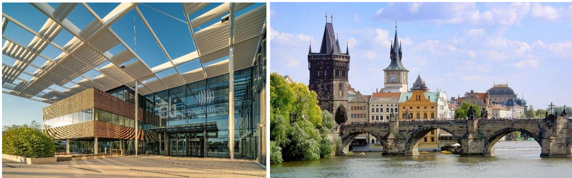
The building of ELI Beamlines in Dolní Břežany and the city centre of Prague

The building includes a lecture hall for 150, a classroom for 40 students, six smaller capacity meeting rooms, three lounges for 20 people each, a library, and a media room. There is also a welcome hall that can serve as a catering area, or event registration and exhibition space.